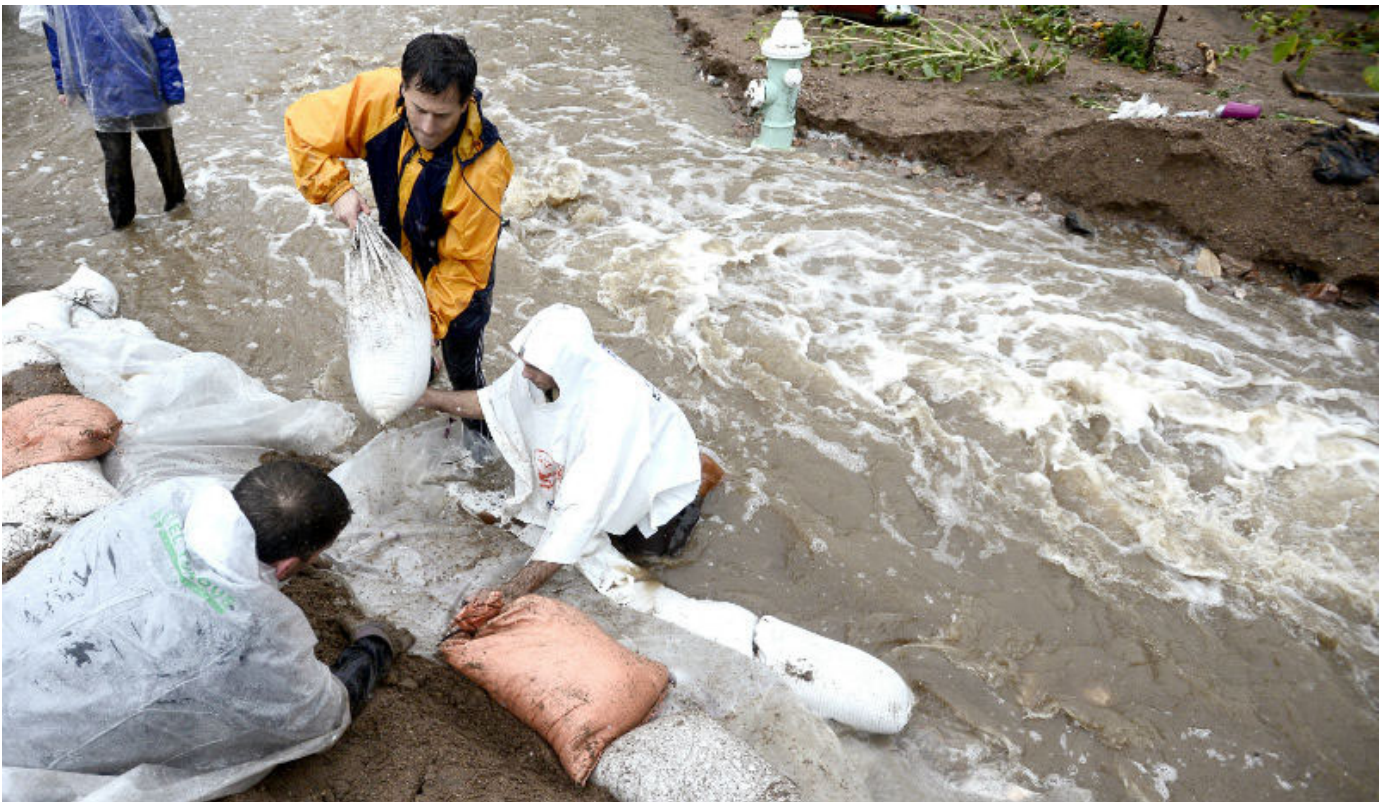
Boulder residents place sandbags to reinforce a berm from flooding in September 2013.

70% of teachers surveyed in rural and urban Colorado teach about natural hazards, but only 30% of teachers address community resilience — a community's ability to respond to and recover from natural hazards — according to a recently published CIRES Education & Outreach study [led by Katie Boyd, Anne Gold and Megan Littrell]. The gap arises from a variety of factors including lack of alignment to the curriculum subjects, absence of the topics in standards/curriculum, lack of time, and lack of personal knowledge. Extreme weather events are on the rise in a warming world, and the work [published in Geoscience Education ] highlights teachers' need for effective and place-conscious educational resources to help students and communities better prepare for natural hazards.