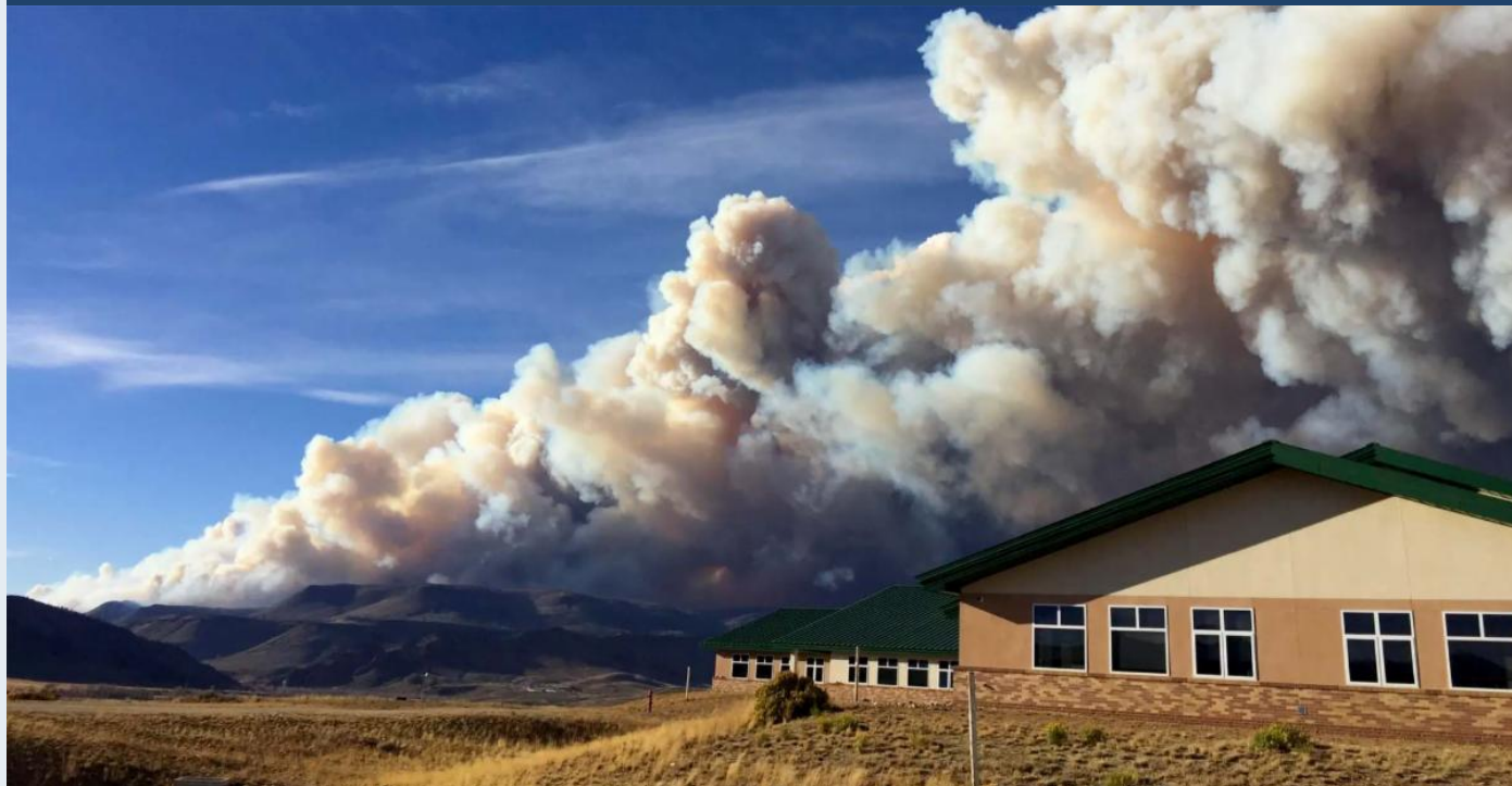
East Grand Middle School, pictured above, was in the path of smoke from the East Troublesome fire.