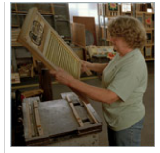
This Land: An Old Reliable Is Called to Serve