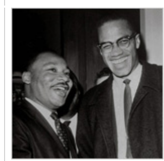
A Fiery Theology Under Fire

Home World U.S. N.Y. / Region Business Technology Science Health Sports Opinion Arts Style Travel Jobs Real Estate Automobiles Back to Top