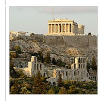
36 Hours in Athens, Greece