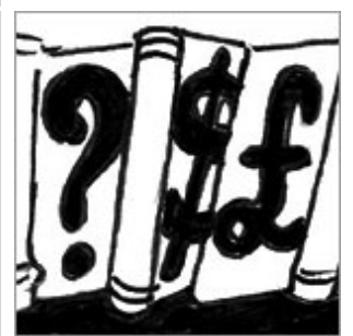
Letters: In the Library, It's Not Just About Books