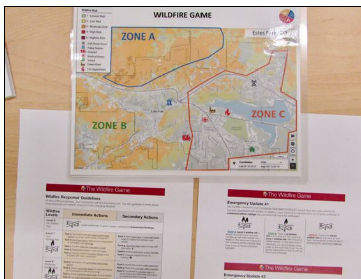
Materials for HEART Force Wildfire Game

It's summer and it has been hot and dry for weeks! The wildfire risk is high in your community. In this game, you will need to act fast and work together to prepare for and respond to an extreme wildfire event. As a community, you will need to assess strengths and vulnerabilities, take stock of available resources, and allocate them during the emergency.