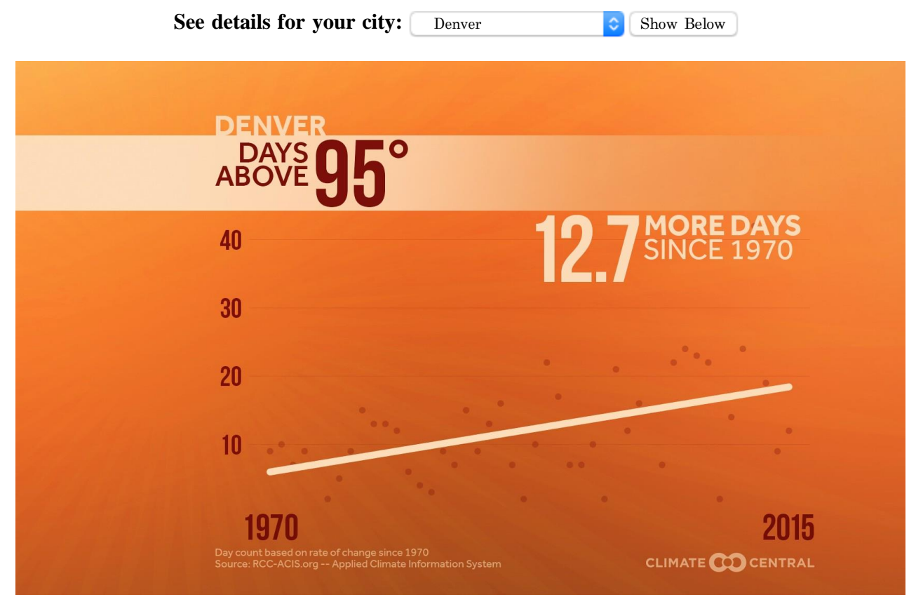
More extreme heat days since 1970

Our analysis of trends in extreme heat days is based on annual counts of 90°F, 95°F, and 100°F exceedances in the country's largest 200 cities. The hottest cities are seeing the biggest average increases in extreme heat days, in general.