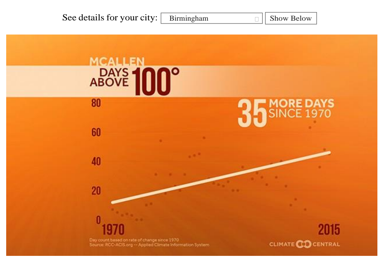
More extreme heat days since 1970

been exceeding 90°F, 95°F, and 100°F since 1970.