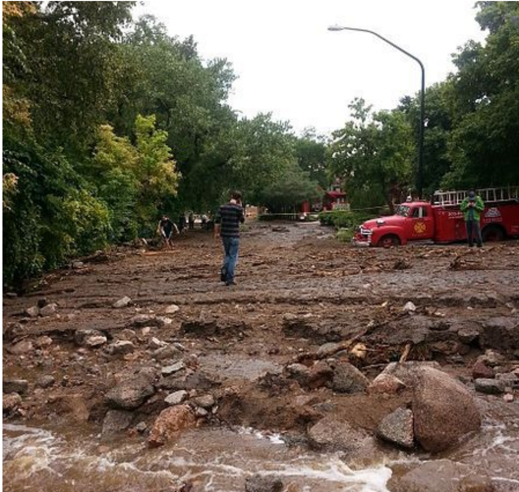
Flood debris after the 2013 Boulder flood.