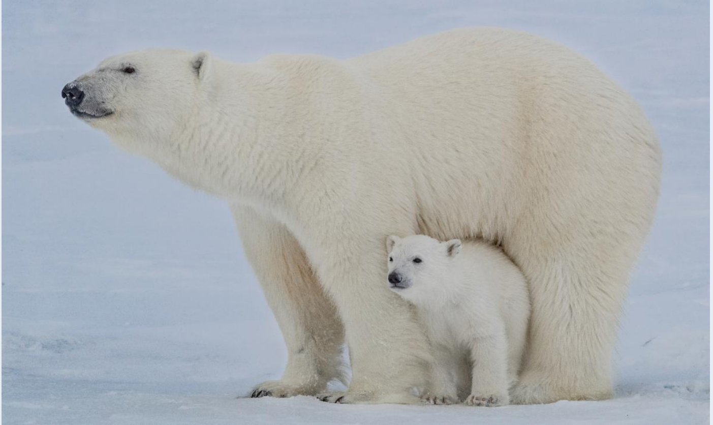
Polar bear mother and cub

The Multidisciplinary drifting Observatory for the Study of Arctic Climate (MOSAiC) was an international research expedition to study the physical, chemical, and biological processes that couple the Arctic atmosphere, sea ice, ocean, and ecosystem. More than 500 participants from over 16 nations spent a year in the Arctic ice collecting important data on the Arctic climate system. From September 2019 through October 2020, the icebreaker RV Polarstern drifted across the central Arctic near the North Pole frozen in sea ice during one of the most extensive Arctic research expeditions ever conducted.