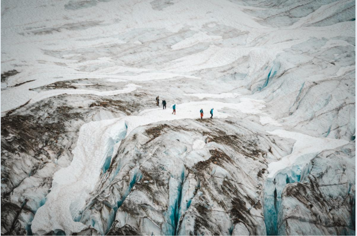
Aerial photo of Lower Curtis