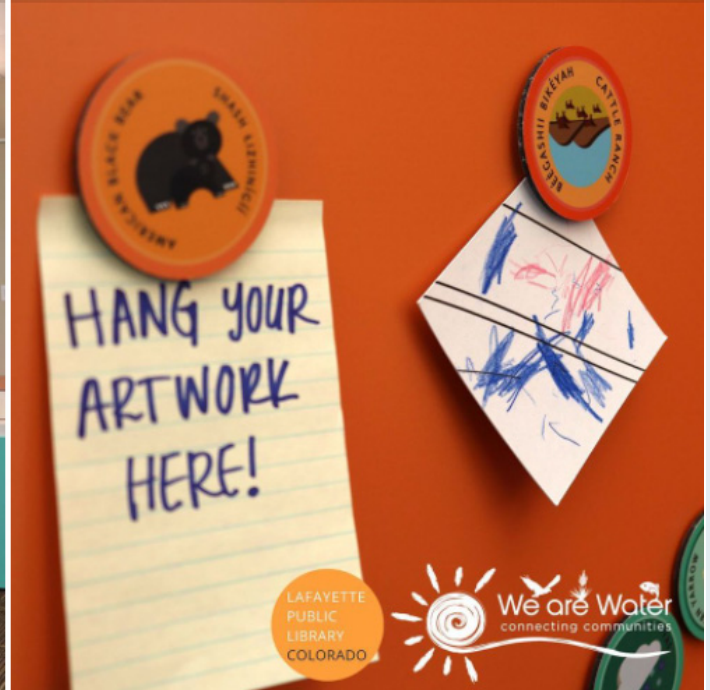
We are Water exhibit at Lafayette Public Library.