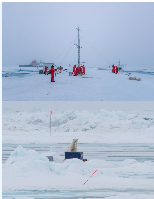
Top: Building Met City; Bottom: Polar Bear Visit.